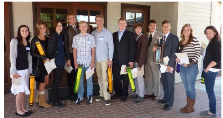
2012 High School Design Competition Finalists.