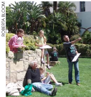
The Santa Barbara County Courthouse.

On February 11, Kids Draw Architecture had a special opportunity to visit the Santa Barbara Bowl for the first time, and to experience the importance of the relationship between architecture and its surroundings. This point is hard to miss at “The Bowl.” Originally built in the 1930s during the Works Progress Administration (WPA), the big outdoor performance “hall” is a superb design that takes full advantage of its dramatic site. With the sky as its roof, all the component pieces are perfectly positioned in this spectacular natural amphitheater setting for an optimal performance experience.