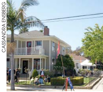
The historic Acheson House.